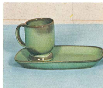
C2—10 OZ. MUG—2.00 5PS—9" PLATTER-TRAY—2.00