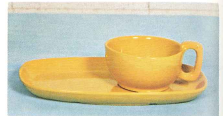
4SC—11 OZ. SOUP CUP—2.00 6P—11" PLATTER-TRAY—2.50