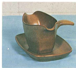
6S—TWO-SPOUT GRAVY—3.00 5PS—9" PLATTER-TRAY—2.00