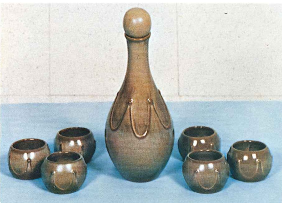
330 SET—DECANTER W/6 TUMBLERS—15.00 331—3 OZ. BEVERAGE—1.50 EACH 330—24 OZ. DECANTER—6.00