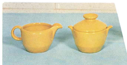
6A—9 OZ. CREAMER—2.00 6B—SUGAR WITH LID—2.50 6AB—CREAMER & SUGAR SET—4.50