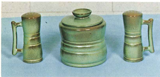
26G—SUGAR/GREASE—5.00 26H—SALT & PEPPER—3.00 PAIR 4-PIECE SET/BOXED—8.00