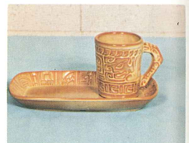
7CL—8 OZ. MUG—2.00 7PS—9" PLATTER-TRAY—2.00