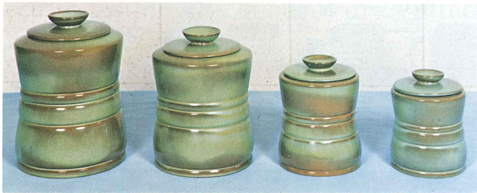
26F—FLOUR, COOKIES, CORN MEAL—9.00