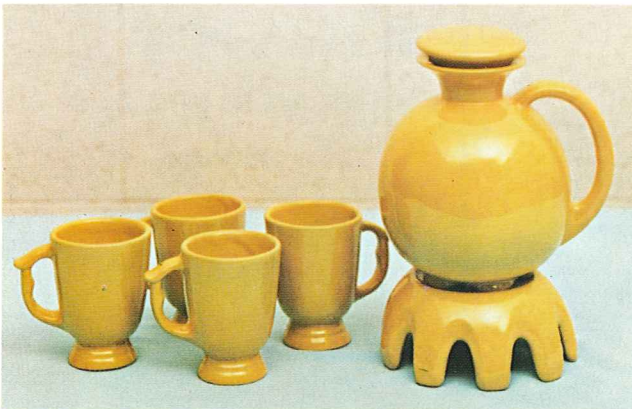
C12— 7 OZ. MUG—2.00 EACH 82—6-CUP CARAFE & LID—7.00 82W—WARMER—3.00 82 SET—10.00